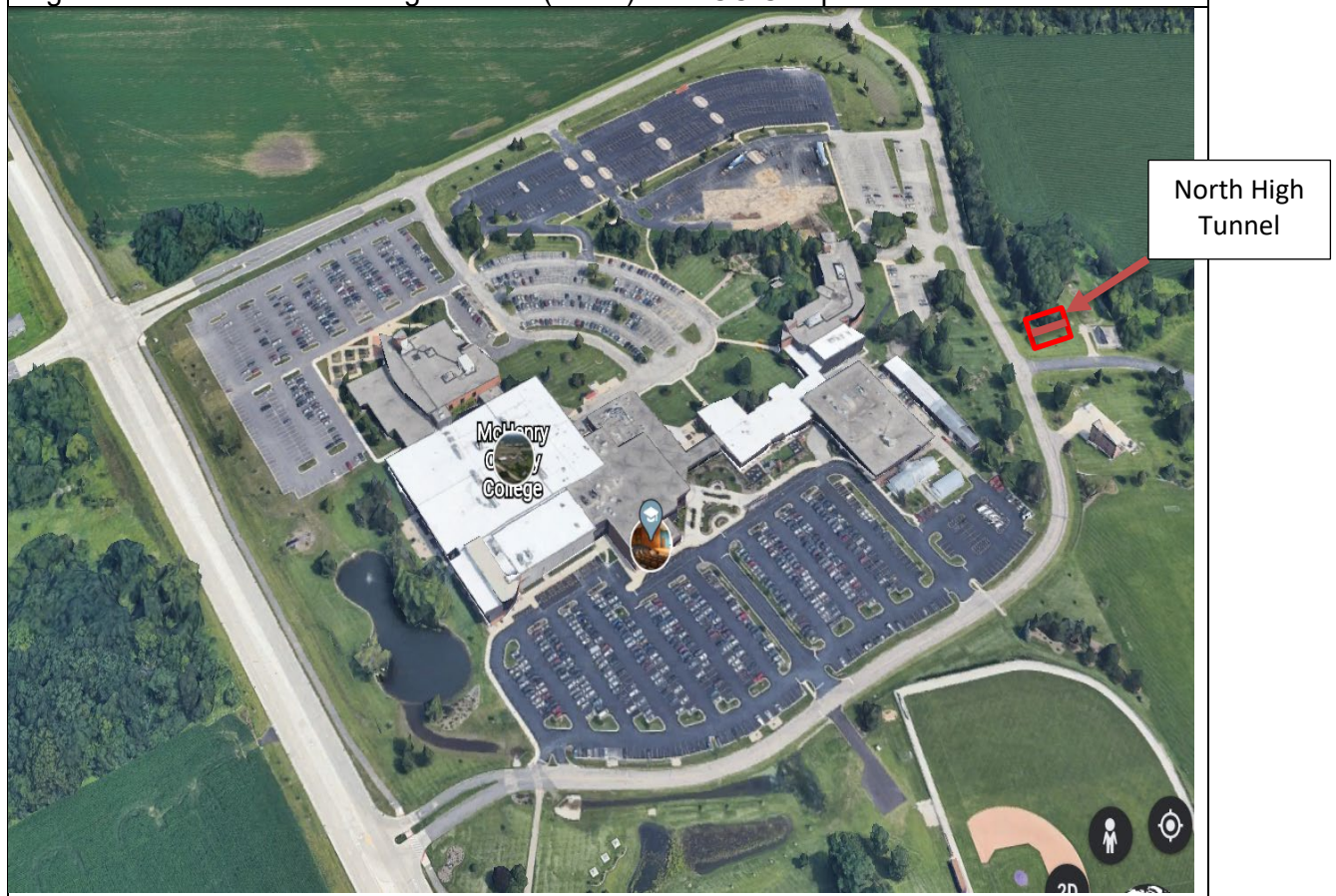
Figure 1. Location of North High Tunnel (1 of 2) on MCC Campus