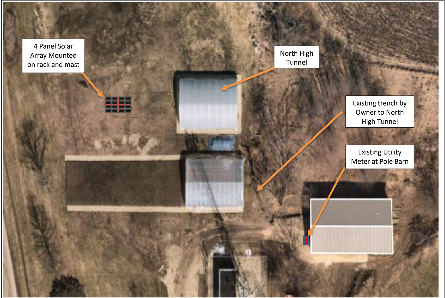
Figure 2. Solar PV Array Location