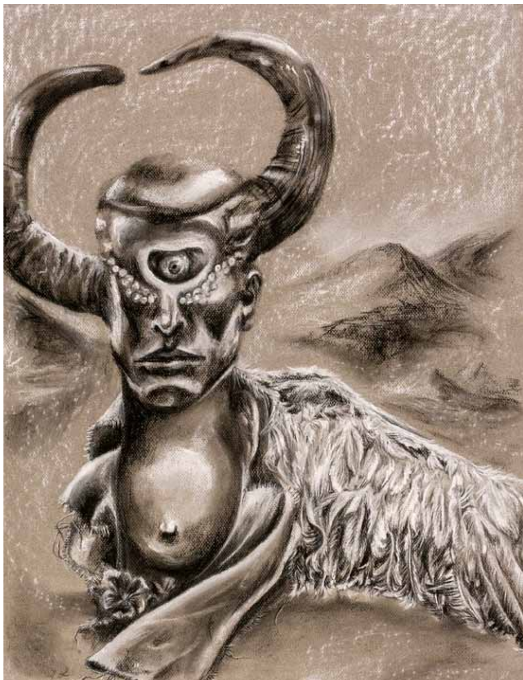
CONTE CRAYON, 25.5" X 19.5"