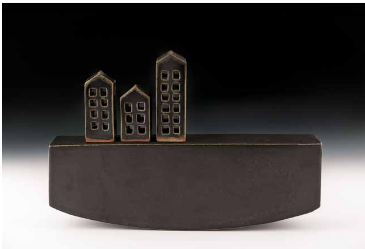
CERAMICS, 4" X 12" X 1.5"

and pull out the object that saved my life.