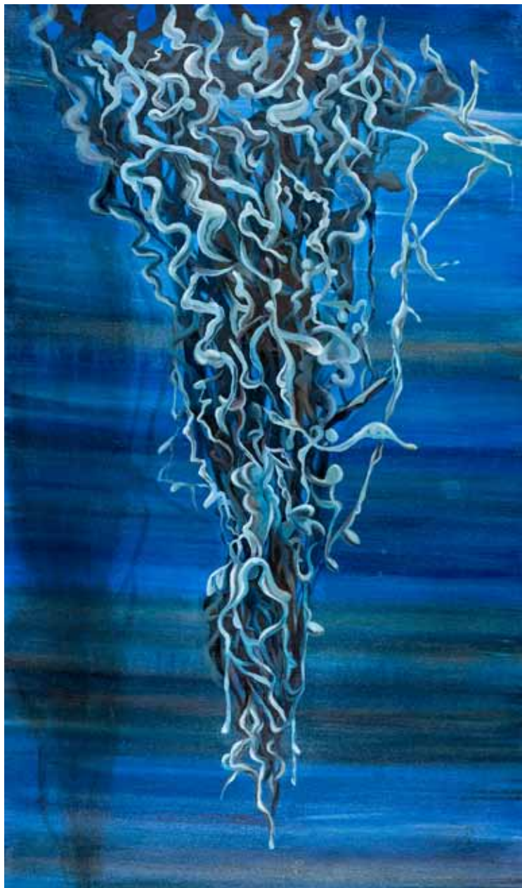
OIL ON CANVAS, 44" X 26"