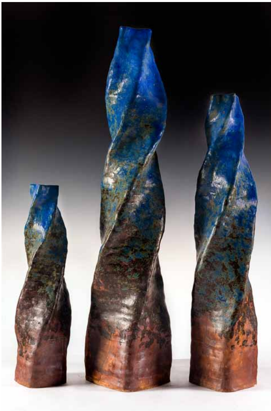
CERAMICS, 48" X 8" X 8," 38" X 7" X 7," 28" X 6" X 6"