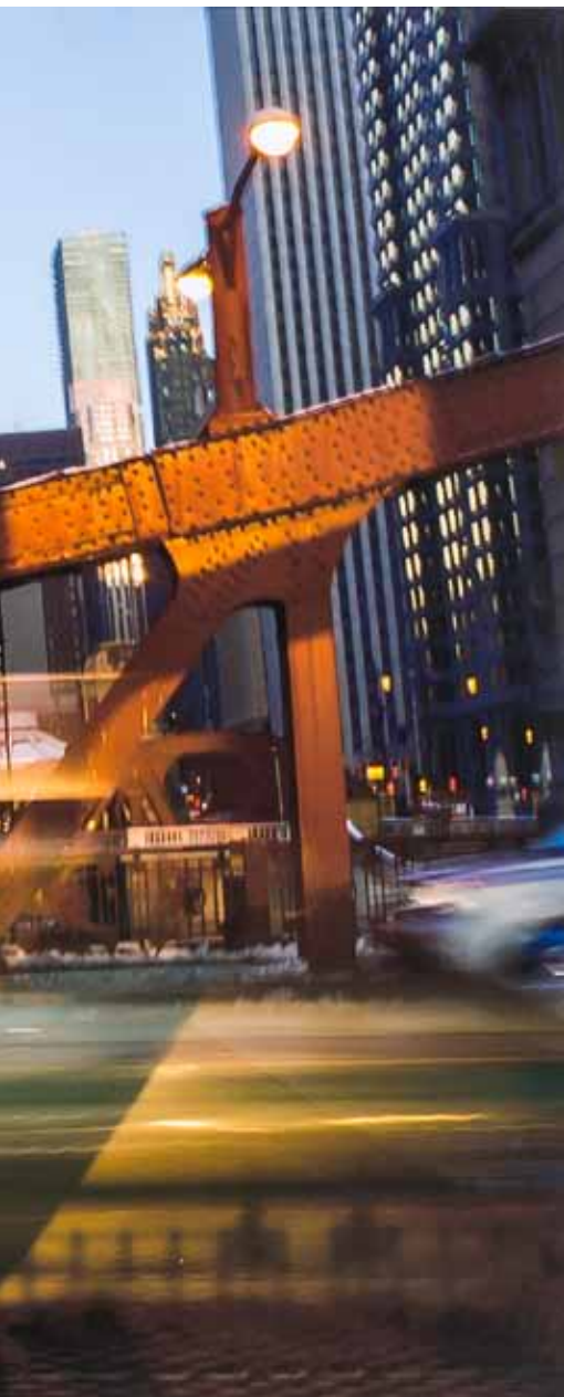
ARCHIVAL PIGMENT PRINT, 17" X 22"