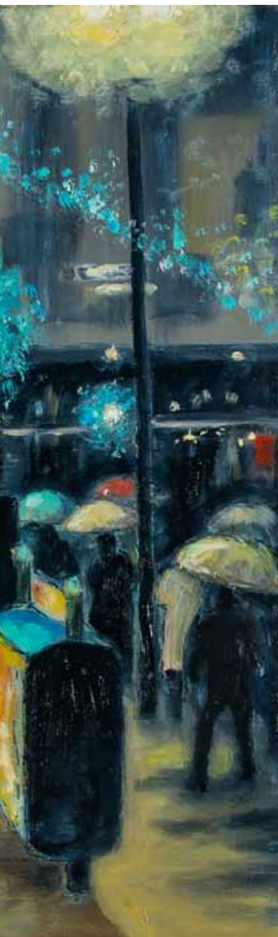
CONTE CRAYON, 25.5" X 19.5"

Misleading promises and wasted hours whip around Lifted up and away, entwined In the dead of October Summer lust lost on the roads behind me Never to turn around