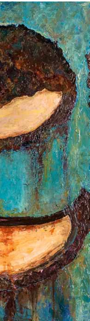
OIL ON CANVAS, 30" X 40"