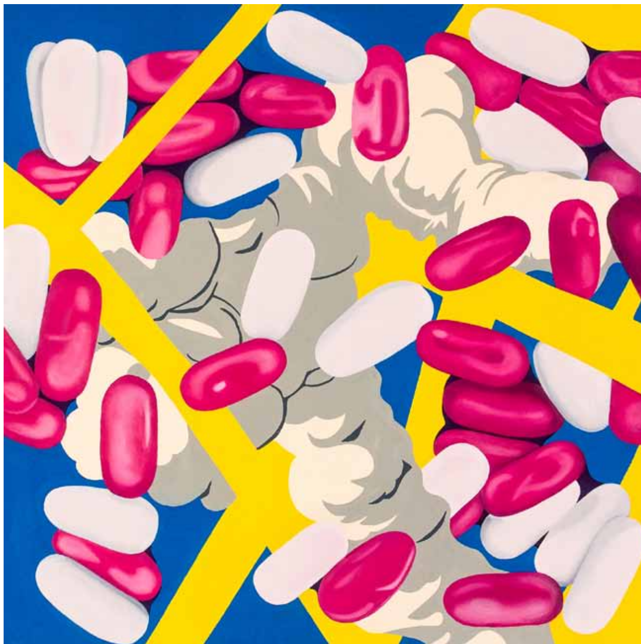
KIM McMASTER Untitled