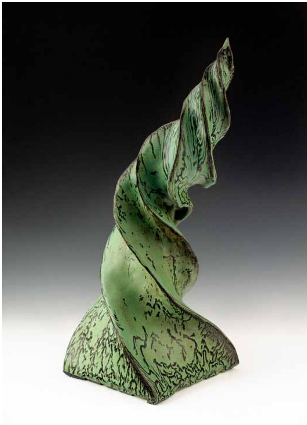
CERAMICS, 24" X 7" X 7"