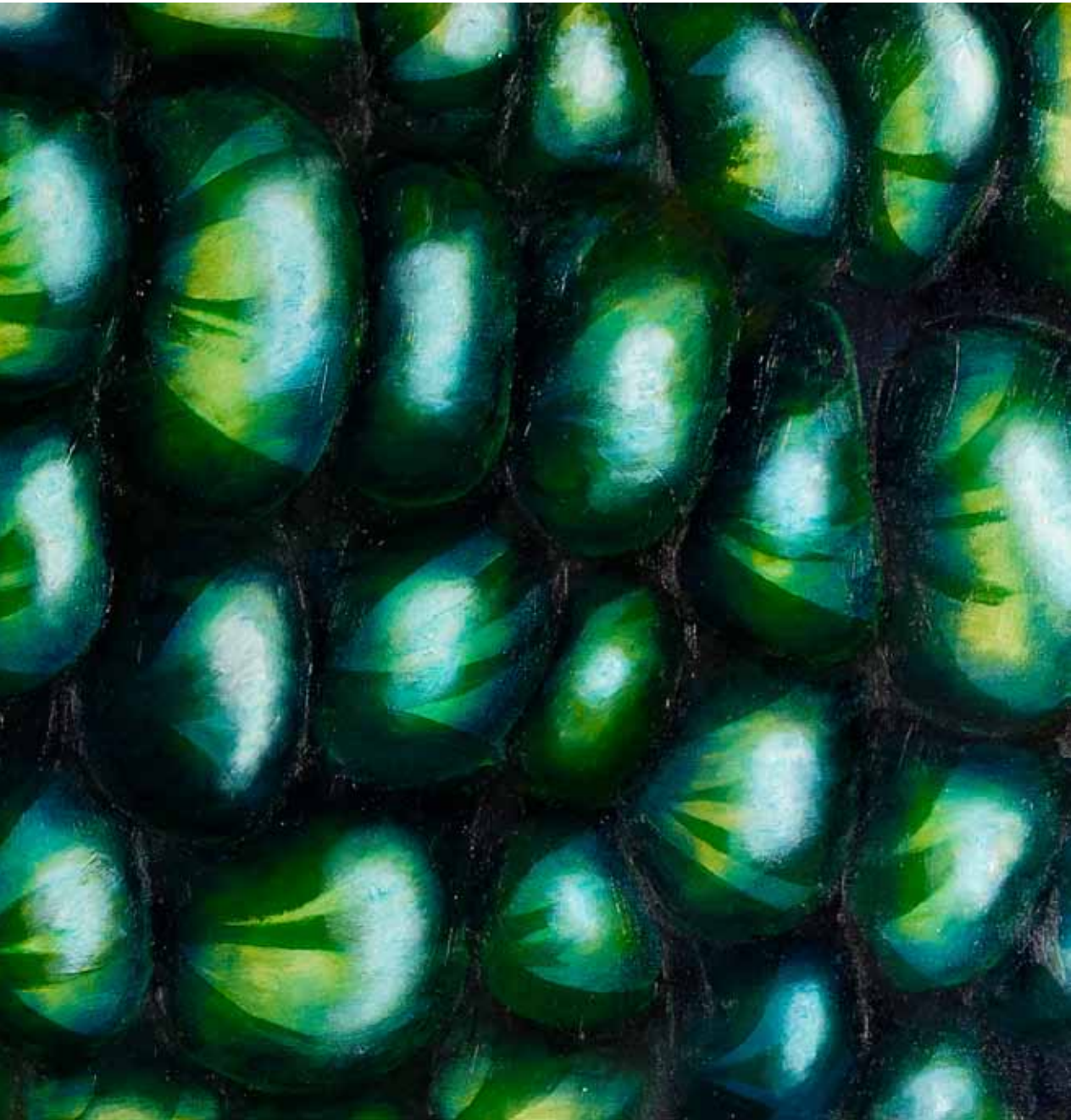
OIL ON CANVAS, 20" X 40"